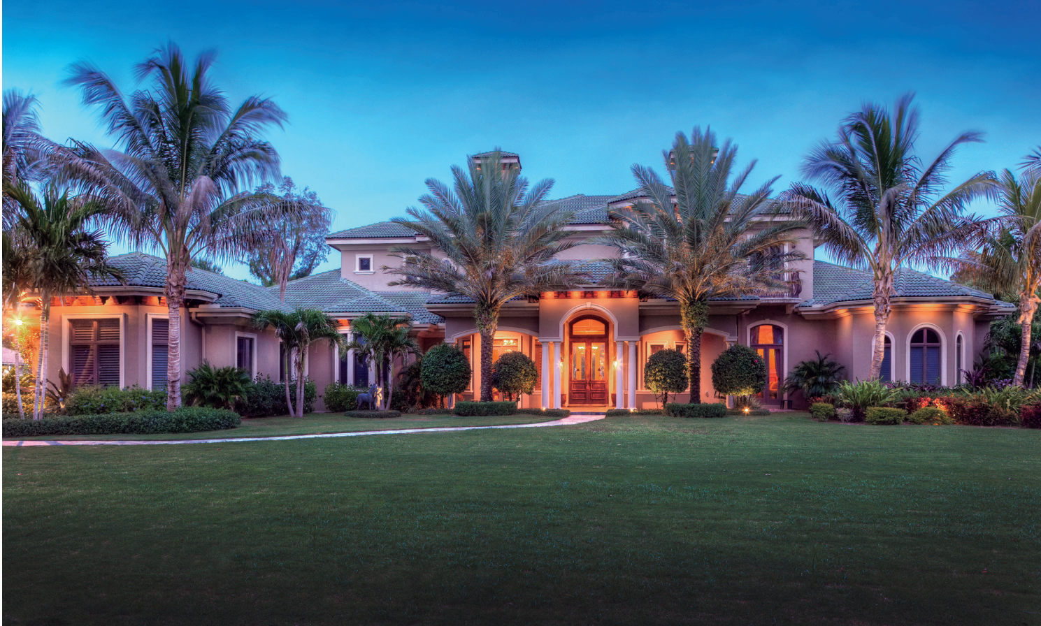
Working with innovative designers and architects, Hobgood Construction enjoys building in many of the most exclusive communities in South Florida.