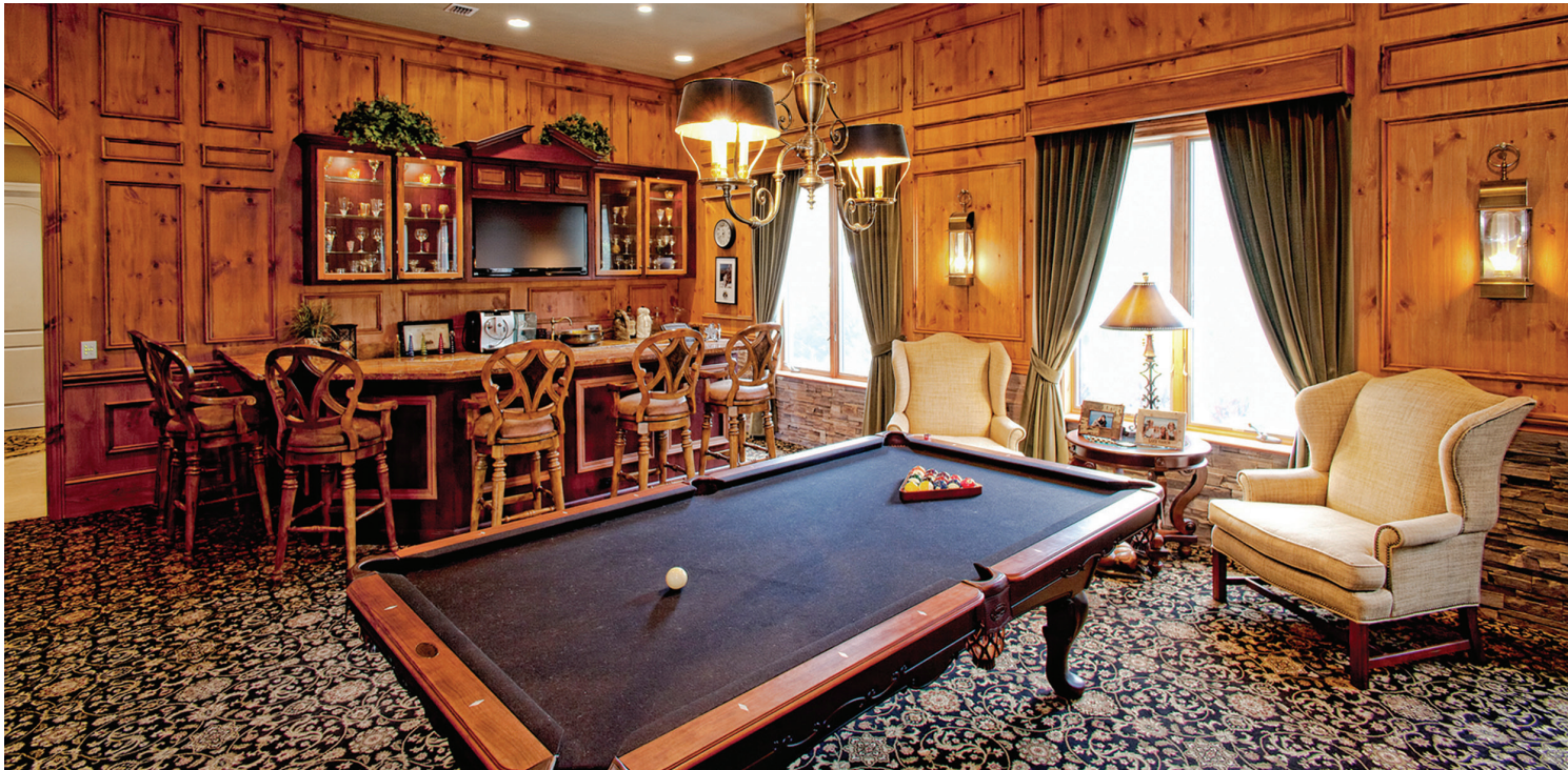
When people invest on some of the most beautiful waterways in South Florida, Hobgood Construction is there to help them maximize the return on their investments.