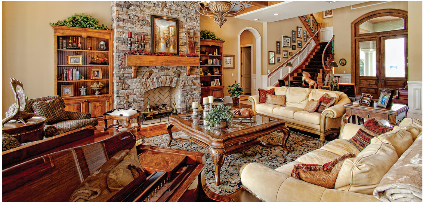
Because of the custom nature of its work, Hobgood Construction works closely with its clients throughout the entire process.

constantly works to ensure full understanding of their vision from the beginning, as well as continuously communicating the often-changing demands of clients.